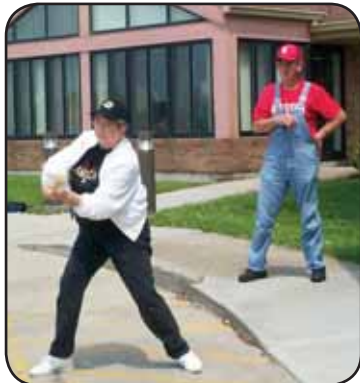
Lack of a ballfield is no hindrance to these players.