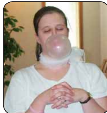
Her bubble has yet to burst.