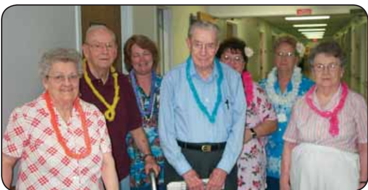
Residents and staff wear leis and other strange and colorful outfits on Hawaii day.