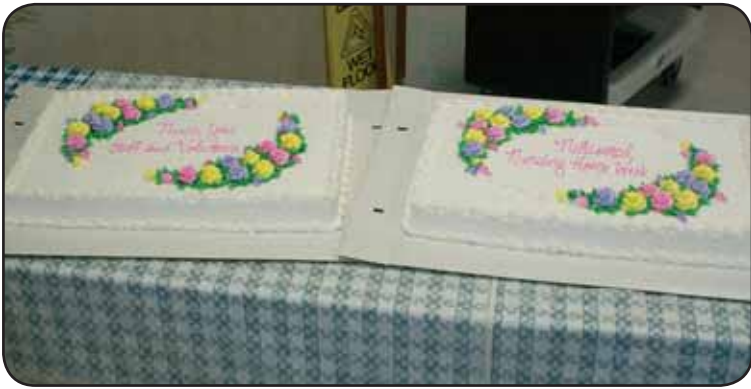
They start the week with cake!

The Baptist Home - Chillicothe does a terrific job with activities for residents year round. During National Nursing Home Week every year, they go all out to have a good time.