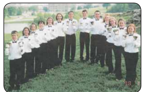
Residents and staff enjoyed a special treat when the Youth Handbell Choir from First Baptist Church of Warner, Oklahoma presented a concert at Chillicothe.