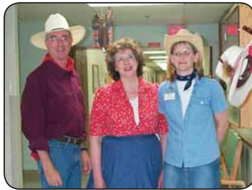
Cowboys and Cowgirls show up during western day.